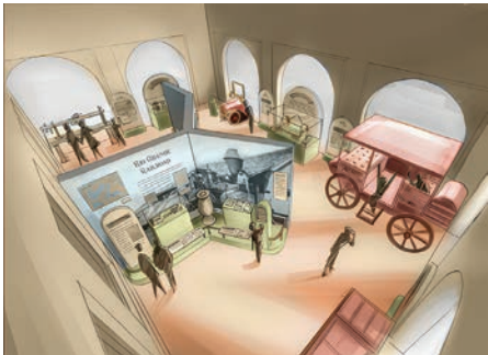
Main depot conceptual designs by MuseWork.

are still seeking funding for phase two as well as for the upkeep, preservation, and restoration to the building (the main depot.) Our goal is to complete the project by 2028, in celebration