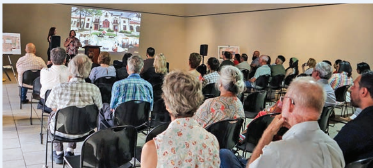
Brownsville On the Move project presentation.

Railroad locomotive by expanding on the information on trains and providing both audio and visual interactives. This gallery will be designed to encourage younger visitors to engage in hands-on learning through a series of interactive activities and provide a dedicated space to learning and engagement. The second phase of the project is the Southern Pacific (main) depot where the