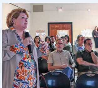
Public comment and questions from attendees.