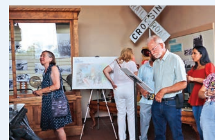
Tours of the Main Depot & Simon Celaya Gallery, highlighting conceptual designs and plans for the galleries.