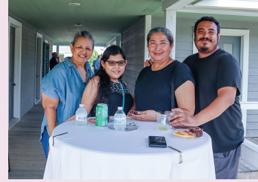
April Historical Happy Hour