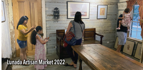
Lunada Artisan Market 2022