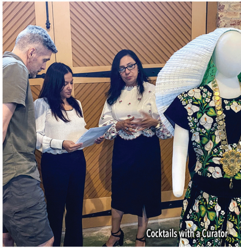
Cocktails with a Curator