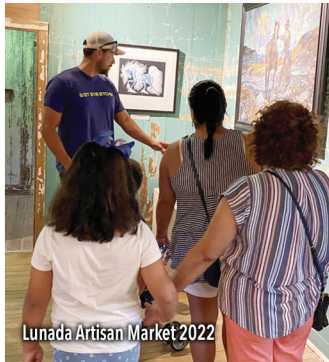
Lunada Artisan Market 2022