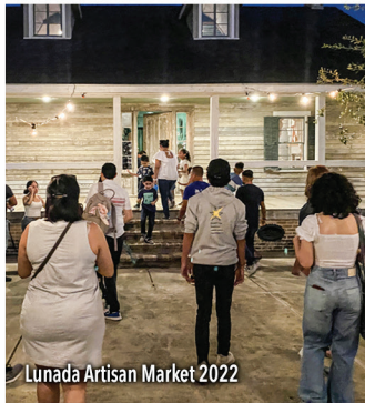
Lunada Artisan Market 2022

Non-Profit Org. U.S. Postage PAID Permit No. 47 Brownsville, TX