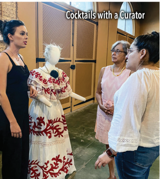
Cocktails with a Curator

CAM Grand Opening Lunada Artisan Market 2022 Cocktails with a Curator