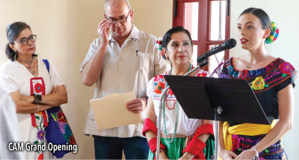
CAM Grand Opening