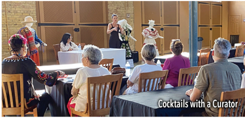
Cocktails with a Curator