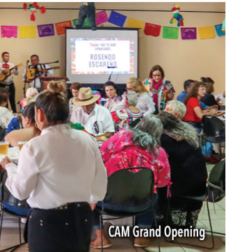
CAM Grand Opening