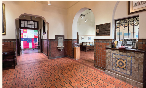
Historic Brownsville Museum Interior 2022