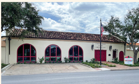
Costumes of the Americas Museum Facade 2022

Historical Association. From June 2021 to August 2022, the BHA began an estimated $200,000 renovation of the Old City Cemetery Center for the relocation. The project consisted of roof repairs, window replacements, HVAC upgrades, and landscaping improvements. On September 11, 2022, the museum opened its doors once again to the public at its new location.