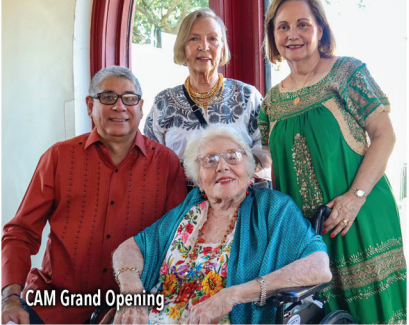
CAM Grand Opening