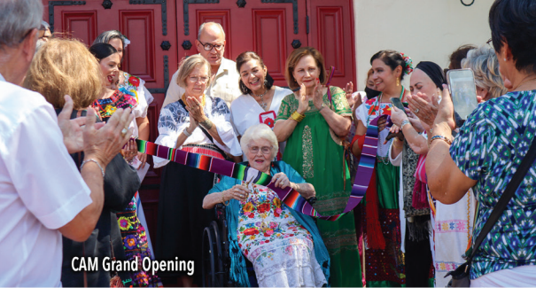
CAM Grand Opening