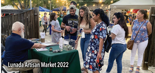
Lunada Artisan Market 2022