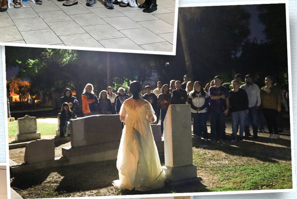
Murder, Mystery, Mayhem Tour