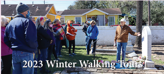
2023 Winter Walking Tours