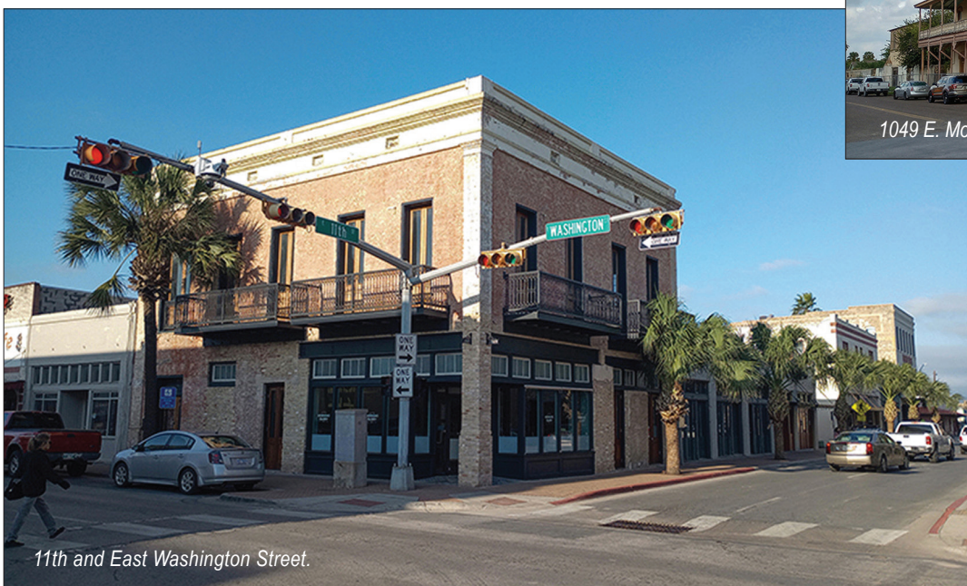
11th and East Washington Street.

"I cannot express the joy and surprise I have experienced in visitors' eyes when I introduce them to Brownsville's rich historic architectural resources! "