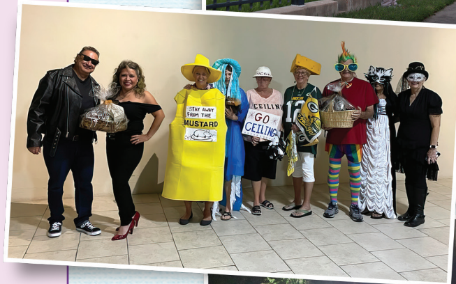
October Historical Happy Hour