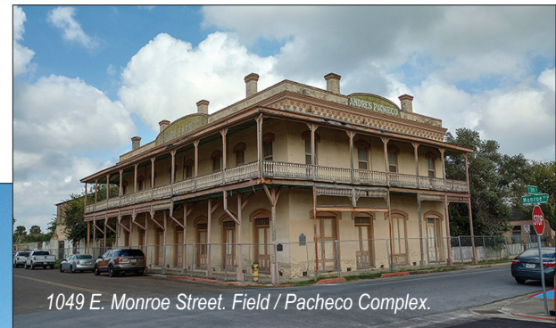
1049 E. Monroe Street. Field / Pacheco Complex.