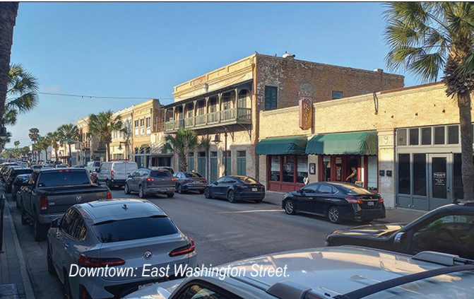
Downtown: East Washington Street.

G reetings! I hope 2023 is off to a good start for all of you! I would like to take this opportunity to spotlight Brownsville's often overlooked and definitely under appreciated cultural treasures- the Historic Architectural Resources.