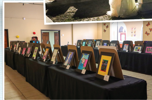
Día De Los Muertos Student Art Exhibit

Sponsorships help make this newsletter possible! Please call us at 956-372-1515, to inquire about newsletter sponsorship opportunities, or visit our website at www.brownsvillehistory.org for more information.