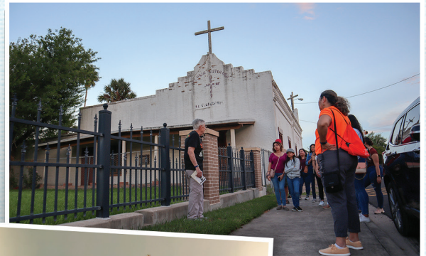
Shades of Haunted History Tour