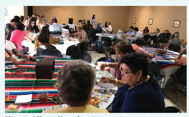
Historical Happy Hour: Loteria