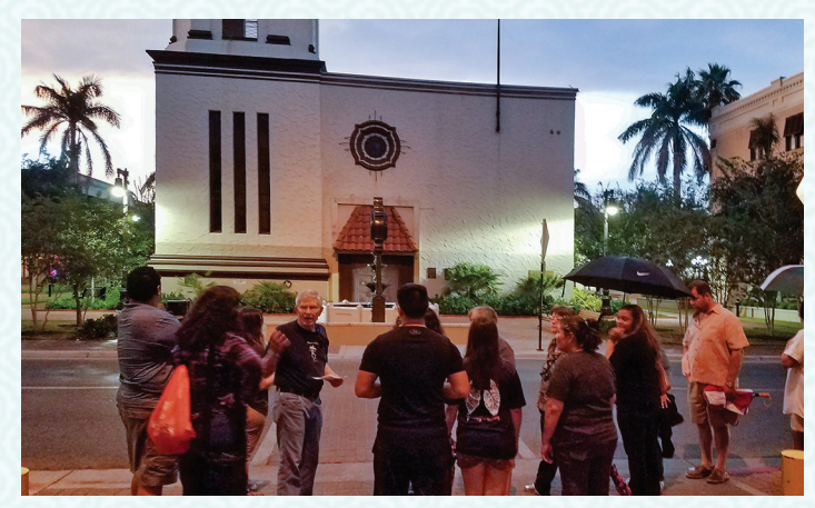
Walking Tour: Historic Market Square