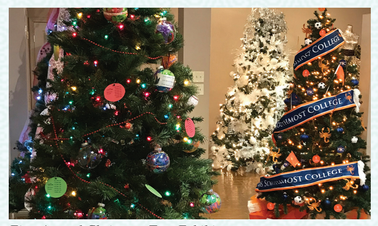
First Annual Christmas Tree Exhibit