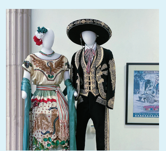
Charro Days Exhibit in Collaboration with Brownsville Museum of Fine Arts and Charro Days Fiesta.