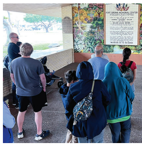
Winter Walking Tour: Fort Brown