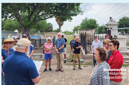
Winter Walking Tour: Old City Cemetery